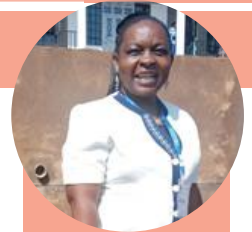
Marble Walter GCI Central